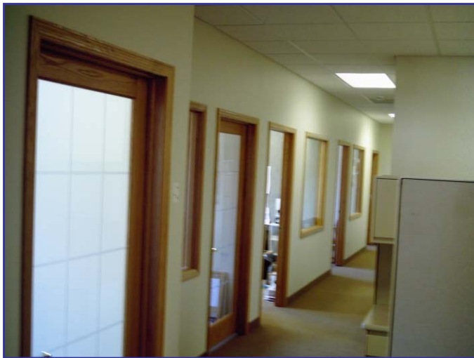
Multiple Private Offices